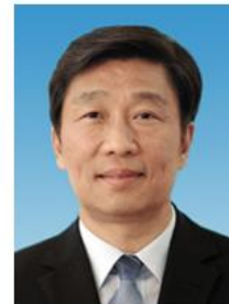
Li Yuanchao VICE-PRESIDENT