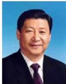
Xi Jinping PRESIDENT