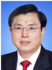
Zhang Dejiang CHAIRMAN (NPC)

The National People's Congress, held every five years, is the highest legislative body of the Chinese state and aims to examine the Government's work over the past years, defining the tasks and guidelines for the following years, as well as elect principal officials of the Chinese Government. The following are the major representatives linked to the Congress: